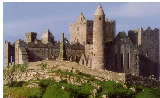
Rock of Cashel