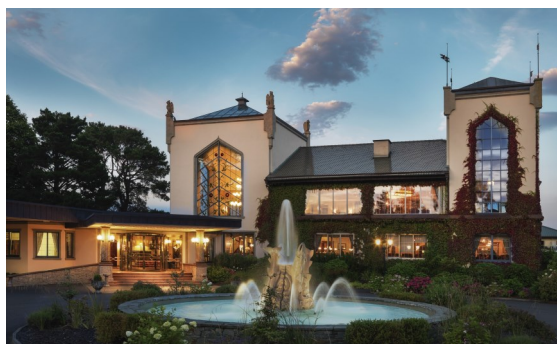
The Dunloe, near Killarney

June 21 - A morning flight home or an afternoon ferry to Wales for those choosing the extension.