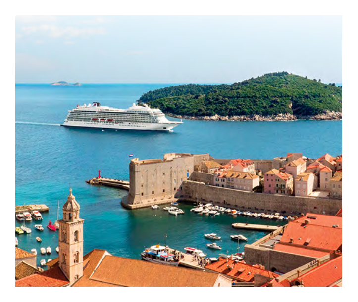
Venice, Adriatic Greece (Viking Ocean Cruises) OCTOBER 13-21, 2024

Trace spectacular Adriatic shores and uncover the glories of the Venetian and Hellenic Empires on this cruise between romantic Venice and classic Athens. Discover Croatia's Dalmatian Coast, explore the palace at Split and stroll Dubrovnik's medieval streets. Sail through scenic fjords to remarkably preserved Kotor, Montenegro's gem. On Greek shores, call on scenic Corfu, with its inviting Old Town, and Katakolon, gateway to the Peloponnese and Olympia.