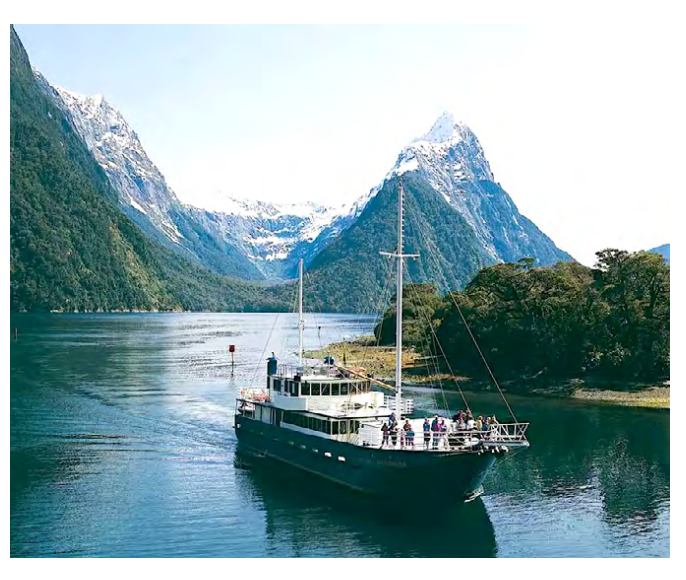
New Zealand: Maori Marvels OCTOBER 25 - NOVEMBER 9, 2024 $10,995/Double • $13,195/Single

This curated experience, blending exploration, local immersion, fine Japanese cuisine and relaxation will be the cultural experience of a lifetime!