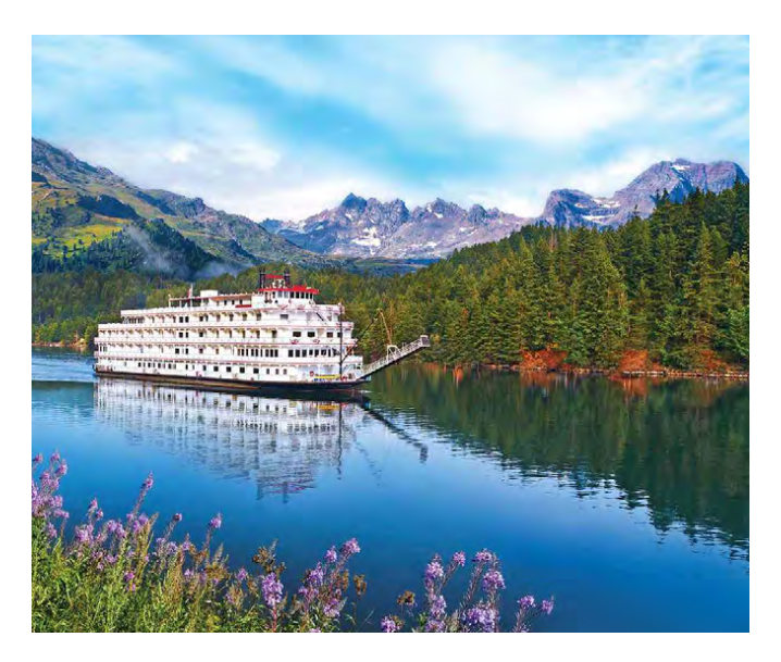
Columbia and Snake River Cruise