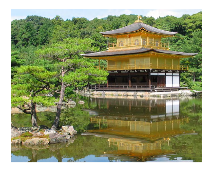
Japan: The Land of the Rising Sun OCTOBER 10-23, 2024 (14 DAYS) $10,950/Double • $13,140/Single

Embark on an unforgettable journey through the vibrant areas of Tokyo, Kyoto, and the Japanese Alps. Immerse yourself in rich traditions that span centuries, all while exploring the contrasting facets of this mesmerizing country.