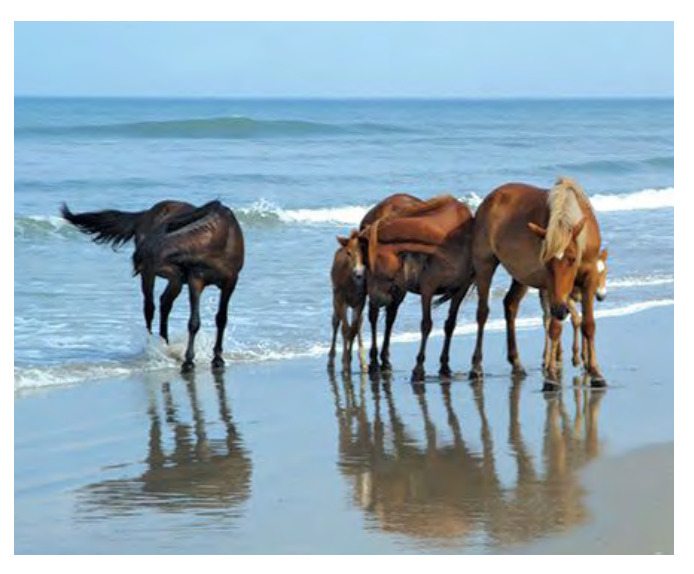
Spring on the Outer Banks APRIL 26 - MAY 2, 2024 (7 DAYS) $2,950/Double • $3,450/Single

Bigger than the imagination! Experience Bible history at the Ark. Meet "Noah, his family, and the animals" on this full-size Noah's Ark re-creation. 510 feet long, 85 feet wide, and 51 feet high, the Ark is a modern marvel. The state-of-the-art Creation Museum allows you to stroll through beautiful botanical gardens and venture through fascinating exhibits about biblical history. But there's a lot more to this tour ... explore Queen City with a guided tour and lunch at Findlay Market. Enjoy the Newport Aquarium, relax on a dinner cruise on the Ohio River, visit Dayton's Air Force Museum and Cincinnati's Museum Center. Unpack for three nights in our newly renovated hotel in the heart of Newport, Kentucky's riverfront district. We'll dine at Historic Boone Tayern and tour Berea College on our trip home.