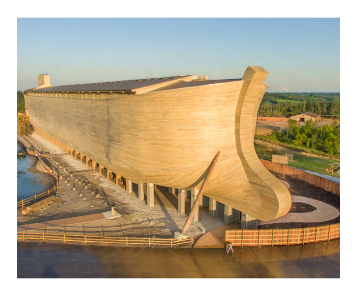
Ark Encounter: Adventure in Cincinnati APRIL 21-24, 2024 (4 DAYS) $1,895/Double • $2,245/Single

Bigger than the imagination! Experience Bible history at the Ark. Meet "Noah, his family, and the animals" on this full-size Noah's Ark re-creation. 510 feet long, 85 feet wide, and 51 feet high, the Ark is a modern marvel. The state-of-the-art Creation Museum allows you to stroll through beautiful botanical gardens and venture through fascinating exhibits about biblical history. But there's a lot more to this tour ... explore Queen City with a guided tour and lunch at Findlay Market. Enjoy the Newport Aquarium, relax on a dinner cruise on the Ohio River, visit Dayton's Air Force Museum and Cincinnati's Museum Center. Unpack for three nights in our newly renovated hotel in the heart of Newport, Kentucky's riverfront district. We'll dine at Historic Boone Tayern and tour Berea College on our trip home.