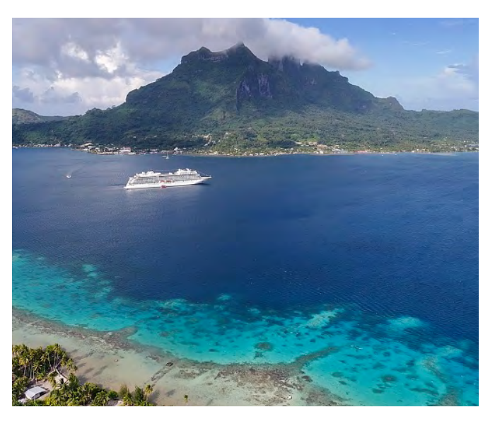
Hawaiian Isles Thanksgiving Cruise (Viking Ocean Cruises)

Fly to Venice on October 13, embarkation October 14. Disembark on October 21 from Athens, Greece and return home.